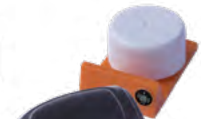
2D Barcode Insert M957BK-2D in place