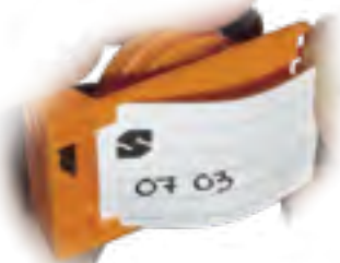
I.D. label and plastic cover available under cat. nos. M956LAB and M956COV