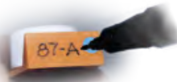
Slanted writing surface