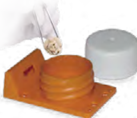
Large chamber designed to accommodate bigger samples