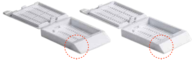
Our original 35° angle cassette